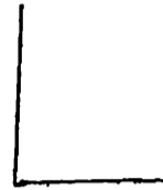
ISA 150 x 150 x 10